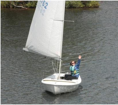
Her First Solo Sail