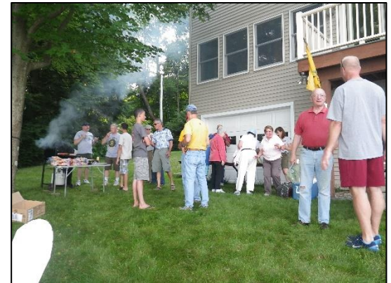
Meet Your Fellow Sailors

Participating in the races is the fastest way to learn and improve sailing skills. Race your own boat (any type) or serve as crew on a neighbor's boat.