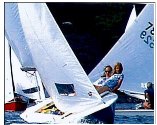
Racing Builds Skills and Confidence