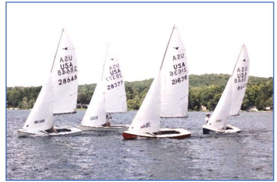
The Start of a Race