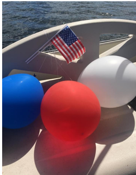
RED, WHITE, BLUE REGATTA