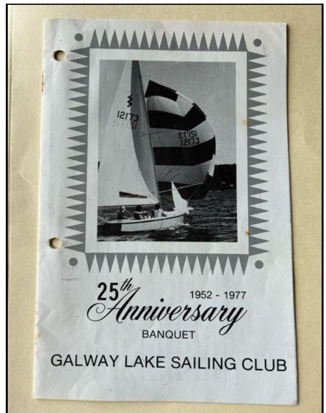
1977 - 25th Anniversary Pamphlet